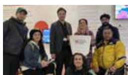
Pages 12-13: Croydon University Centre News