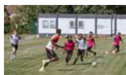
Pages 18-20: Coulsdon Sixth Form College News