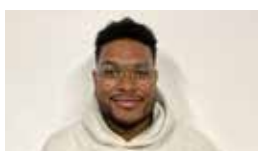
Page 3: New Faces