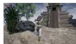
Pages 22-23: Art and Design News